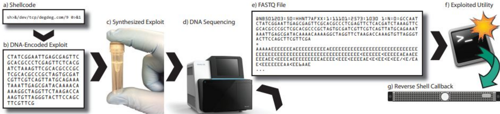
Figure 3: Our working exploit pipeline